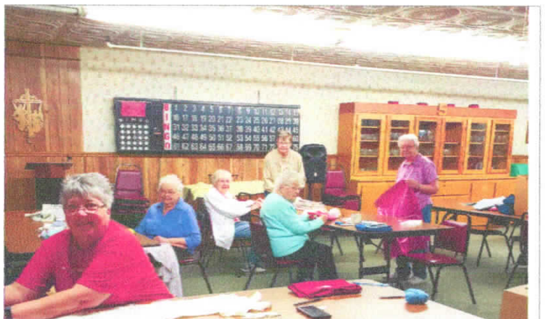
Heritage Bible Church Quilters