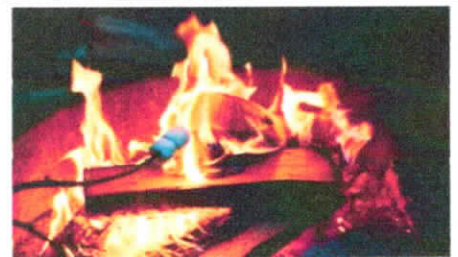
Friday Night Firesides AT Faith Bible Church

We will be serving hot dogs, s’mores, and whatever people decide to bring. When it gets dark we will be showing in our outdoor theater episodes of “The Chosen” which is a mini-series on the life of Christ.